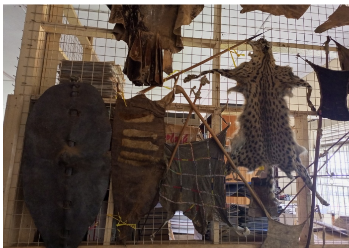
Figure 5. Showing animal skins used in communities.

The library administration is also considering online exhibition of its heritages to the entire world through its library website. It was noted that online exhibition given opportunities to all museum lovers and communities to view and read about cultural heritages in the possession of the library without physical presence in the library. It was noted that once implemented, online exhibitions will go a long way in promoting and cultural heritages in the library (See Figure 5 ).