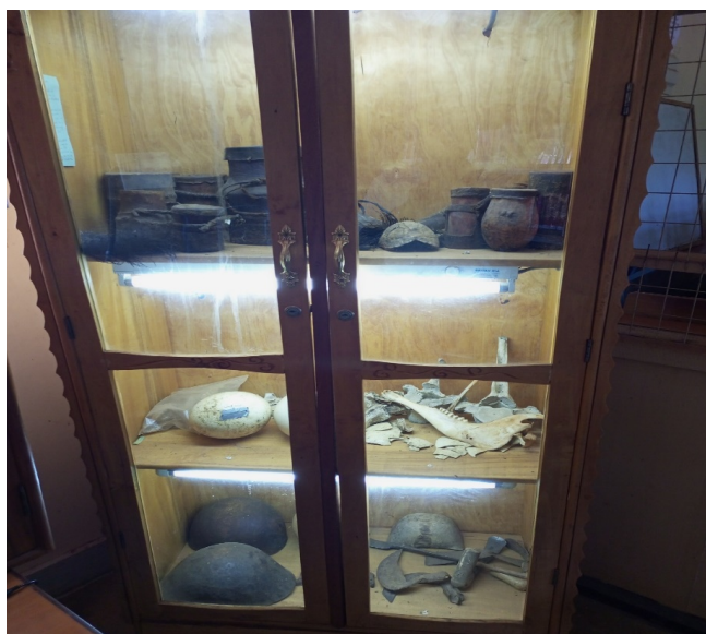
Figure 4. Showing cultural heritage preservation.

Temperature and relative humidity are monitored to ensure a controlled environment in which the heritages can thrive. The museum in charge is expected to monitor temperatures and relative humidity effects on the heritages at regular intervals and also regulate light use in the area.