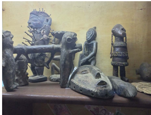
Figure 2. Cultural heritages depicting civilization.

The library administration is aware of the value of intangible heritages in preserving culture although they are challenged by the absence of equipment and tools for capturing and preserving this type of cultural heritage (See Figure 2 and Figure 3 ).