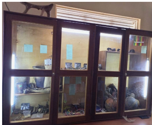
Figure 3. Showing cultural heritage preservation tools and body adornments.