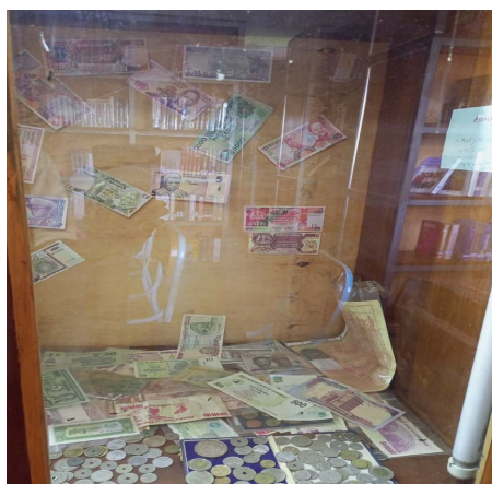
Figure 1. Showing evolution of currencies.

Legal tender or money. The currencies address the evolution in the money currency of different regions especially Uganda. The Ugandan currency notes are maintained at the museum depicting the transformation of currencies. (See Figure 1 )