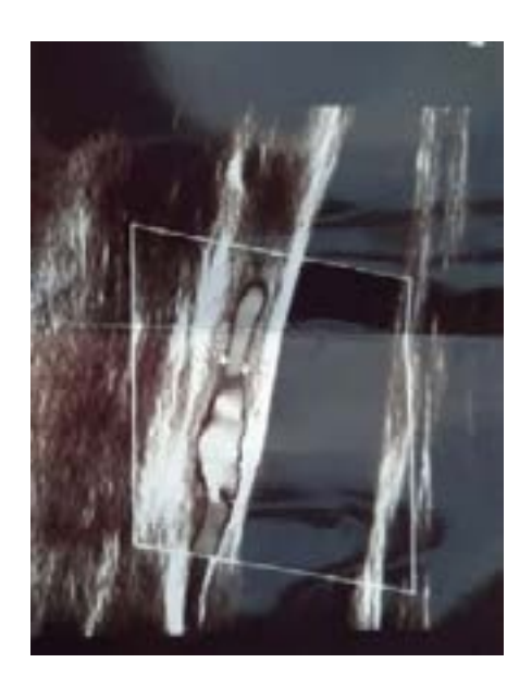
Fig 3: Doppler ultrasound of the left vertebral artery showing reverse flow (subclavian steal syndrome)

After reviewing the findings, we made a diagnosis of Takayasu's Arteritis with convulsive syncope. The patient was started on nifedipine 20 mg twice daily, with prednisolone 30 mg once a day; anticonvulsants were stopped. She was observed for one week on this treatment, the symptoms subsided and the ankle BP came down to 145/90 mmHg. The patient was discharged, and the dose of prednisolone tapered down to 10 mg daily over 4 weeks. She had a normal vaginal delivery at term to a male baby weighing 4.0kg. During the post-natal review, her BP was recorded as 115/75 mmHg and pulse of 80/minute in the upper limbs and she had no symptoms.