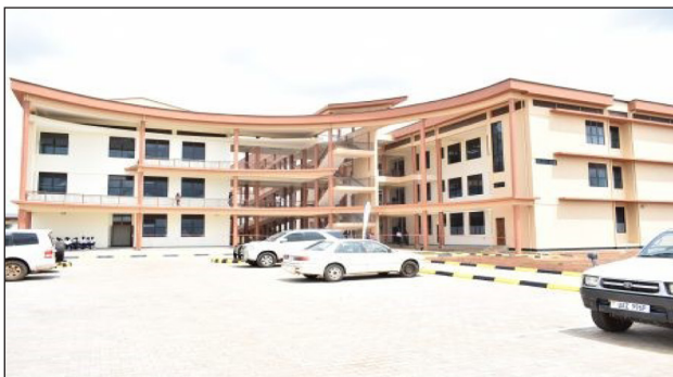
Figure 2: Showing Lira University Teaching Hospital where the Midwifery students conduct clinical practice and patient care.

Also incorporated are advanced newborn care competences such as neonatal resuscitation, kangaroo mother/father care, cord care with chlorhexidine 7.1%, antibiotic therapy, incubation, phototherapy, Vscan, et cetera. Additional competences include anesthesia and theatre techniques, assisted cesarian section and first and second line management of major maternal and newborn disorders in antepartum, intrapartum, and postpartum periods.